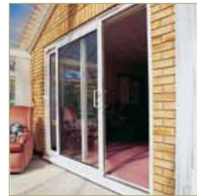
Ideal for rooms leading into a conservatory